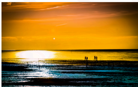
Wadden Sea / Cuxhaven