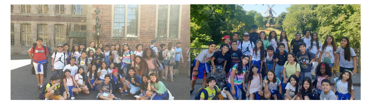
Sunday, 29th June

The weekend started with a trip to Bremen on Saturday. The students discovered the beautiful old city trough a city-rally. Of course everybody made a photo in front of the famous monument of the "Bremer Stadtmusikanten" (Bremen Town Musicians). Within the rallye erverybody learnt a lot. The winners of the rally were able to take home some great prizes. But for the effort everyone got an ice cream at the end.