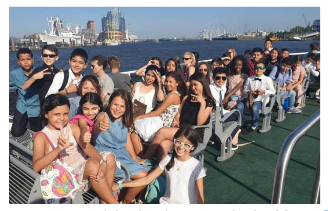
Wednesday, 25th June

everyone visited the musical Marv Poppins in Hamburg harbour. То understand everything the students learned German words like "Kindermädchen" (Nanny) and "Regenschirm" (Um-brella). The students dressed accordingly and also the journey by ferry made the trip a magical experience. Really "Supercalifragilisticexpialigetisch"!