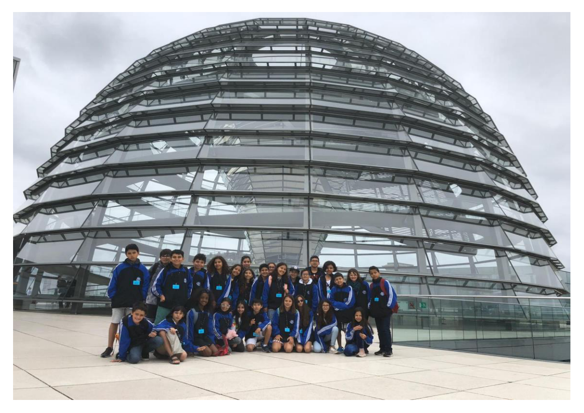
On top of the Bundestag right in front of the dome